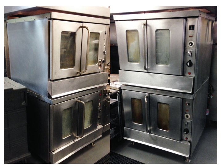
Pre-makeover convection ovens (Units A & B)

The Moffitt Café serves as the Medical Centers' main dining facility serving breakfast, lunch, and dinner for dining room patrons and room service from 7 am to 7 pm daily.