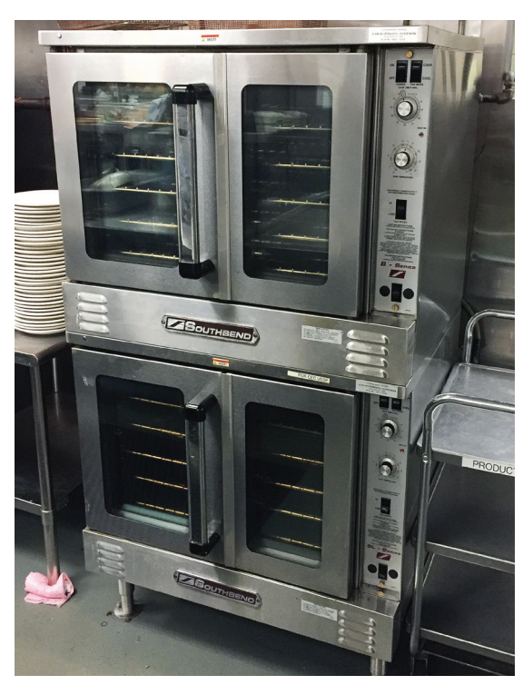
ENERGY STAR convection oven (Unit B)