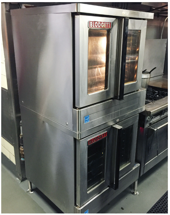
ENERGY STAR convection oven (Unit A)